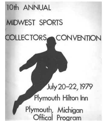
Table holders would leave their cards in a ballroom overnight, maybe with a sheet covering them for security. A table fee at a three-day 1975 Chicago show was $7.50. Star athletes were just starting to be priced at premiums and card condition was not of utmost importance. Some table holders would bring non-sports.