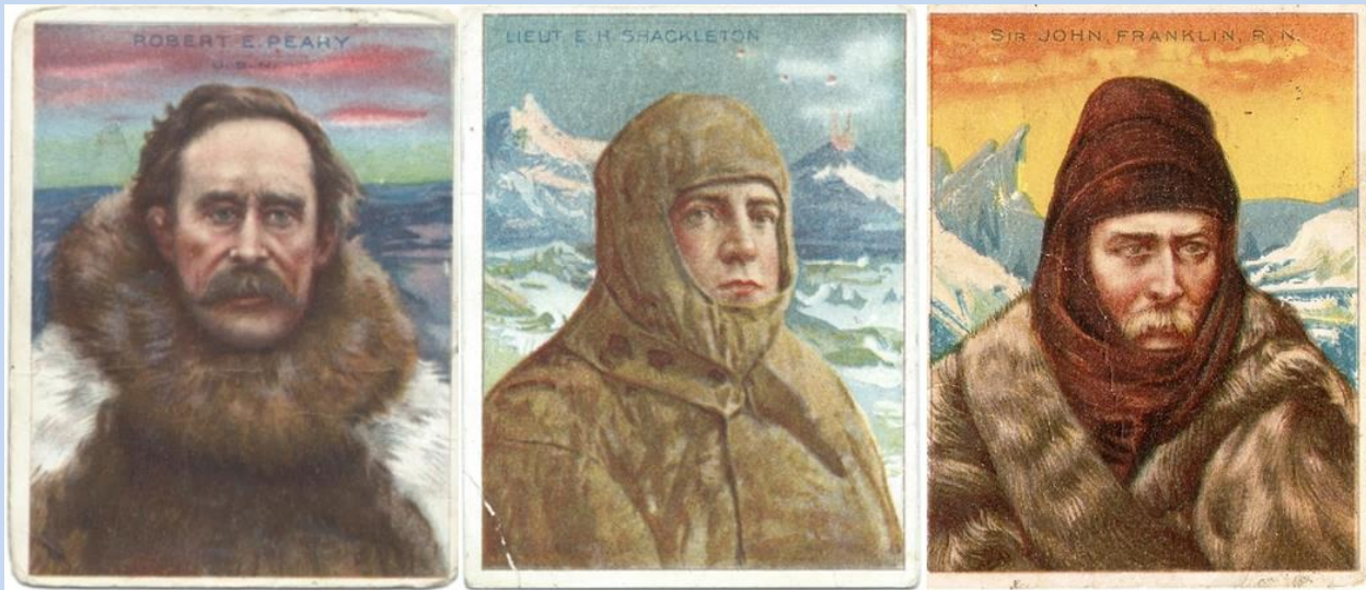
Peary, Shackleton and Franklin