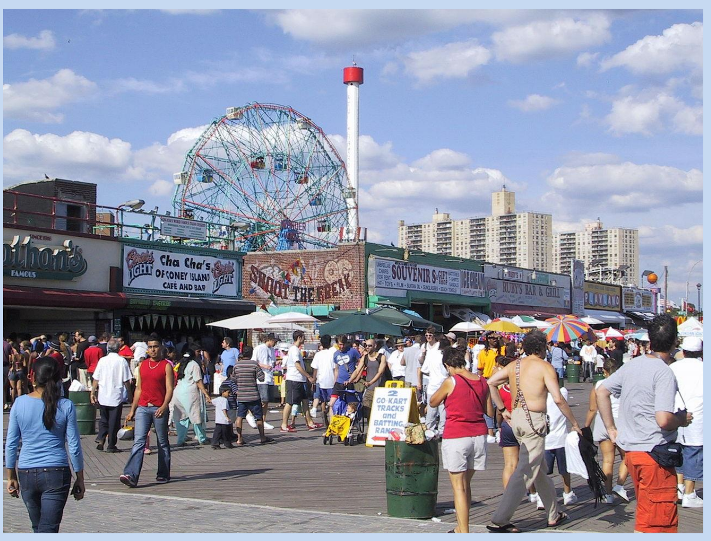
The arcade machines came from Harry's Arcade at Coney Island. Coney Island Boardwalk 2003